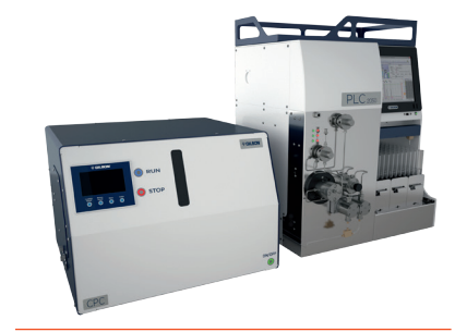
Figure 3 CPC 250 PRO with PLC 2250 Purification System