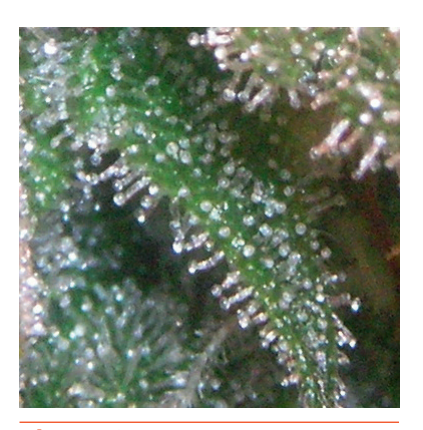
Figure 2 Closeup View of Glandular Trichomes on the Surface of a Cannabis Plant.